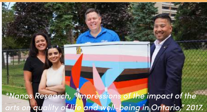
*Nanos Research, "Impressions of the impact of the arts on quality of life and well-being in Ontario," 2017.

of Ontarians believe that the arts build a shared sense of community identity*